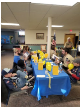
Blue and Gold Banquet