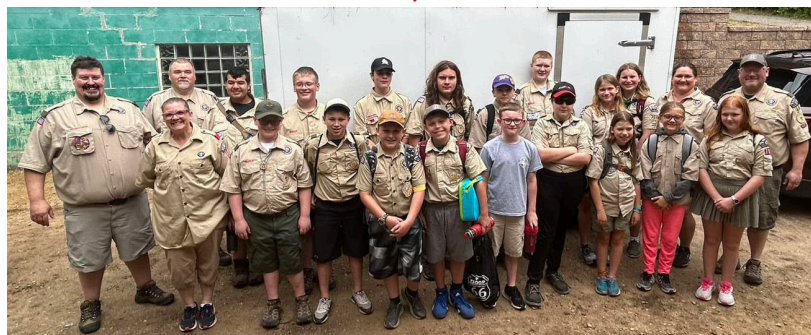
Troops headed to Summer Camp!