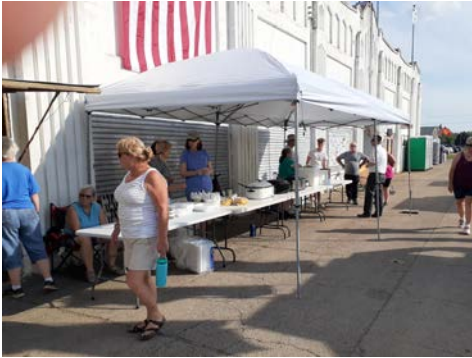
"Meal @ The Fair"