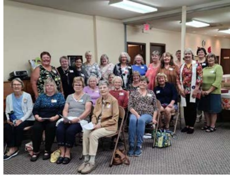
Presbyterian Women's "Fall Workshop"