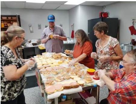
Packing "Summer Lunches" for the Summer Lunch Program